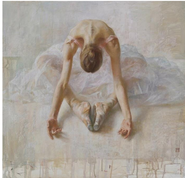
Art, by Elena Prudnikova

PSME 20 th International Exhibition First Place;